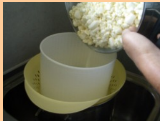
Emilio's gorgeous cheese

I work on a local beef-sheep-deer farm, have my own cropping farm but my passion for cheesemaking has never diminished. I am trying to find the true characteristics of Italian cheese taste and flavour using local "white gold" which is what I call your wonderful NZ milk.