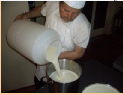
Lombardia andl decided to move there.